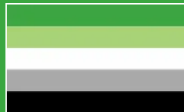
The Aromantic Flag

http://www.arospecweek.org/?eType=EmailBlastContent&eld=bbe135b7-c68b-4925-ad32-a46adade6c09